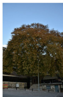
Libohova Sycamore Tree