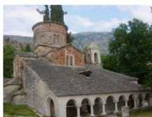
Church of the Dormition of Theotokos